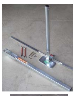
Step I: Place contents of box on floor or table. Place handle over riser tube with decal facing up and insert short 1/2" - 22 bolt.